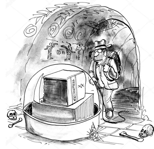
At last he had found the Regulatory Guidelines.