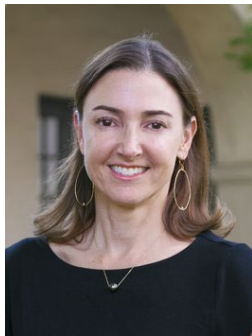
Case Cortese Dir, Innovation