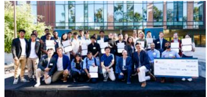
Bill Gross Prize for Entrepreneurship