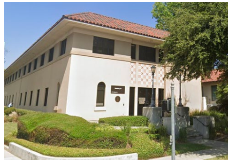
CIC 271 S. Chester Ave